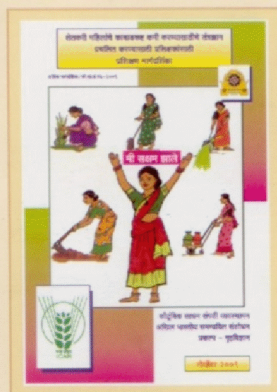
Trainers' Training Module on Drudgery Reducing Technology interventions for Women in Agriculture